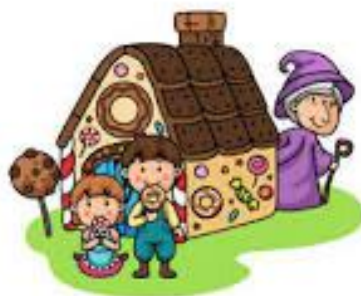
C HART HEADTEACHER